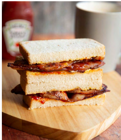
Butties Bacon or egg (£2.35 supplement)