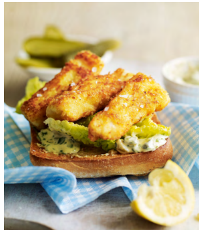
Fish finger sandwiches