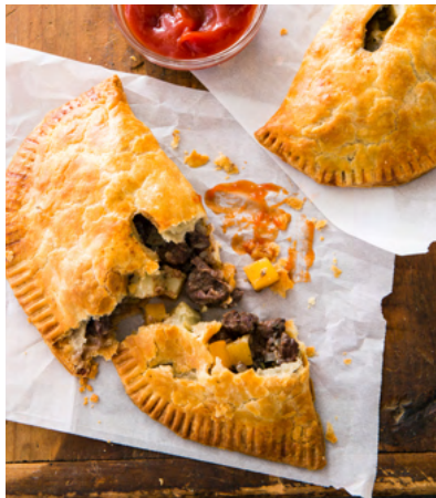
Cornish pasties with chef's choice fillings