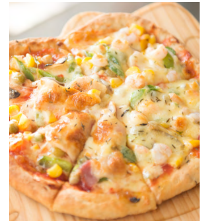
Pizza and Focaccia with chef's choice toppings

Minimum catering numbers apply - pricing based on a buffet. A supplement will apply for served food.