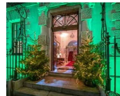
Christmas at No.11 Cavendish Square