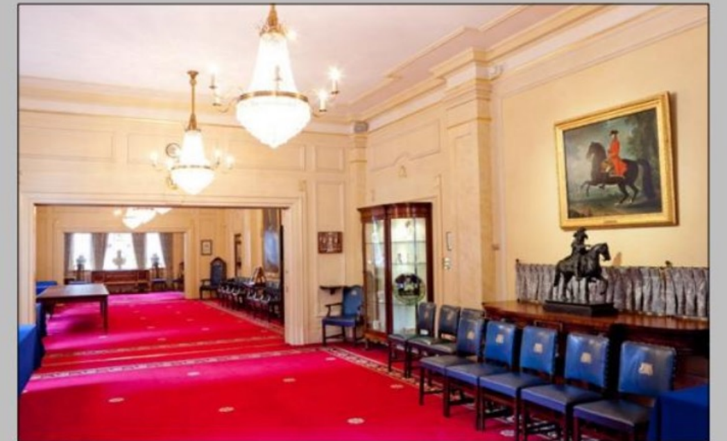
The Front Rooms