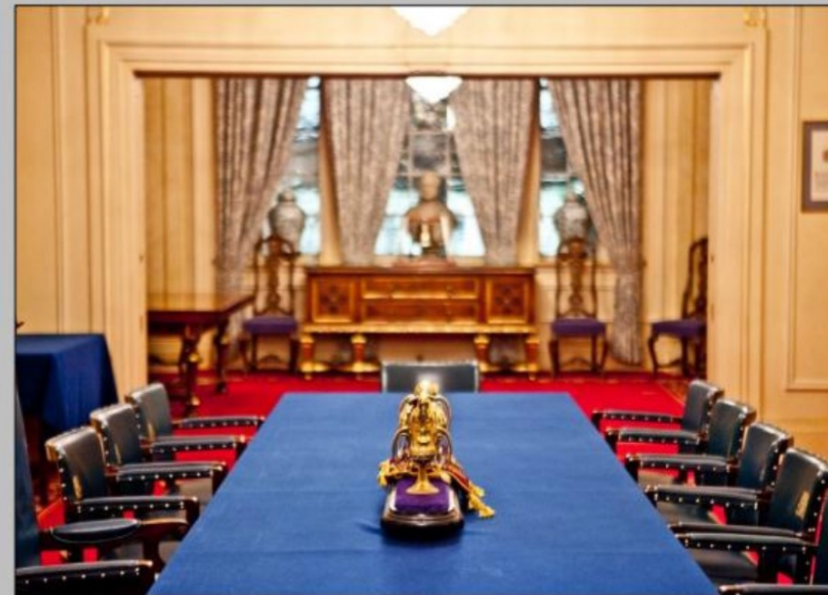
The Court Room