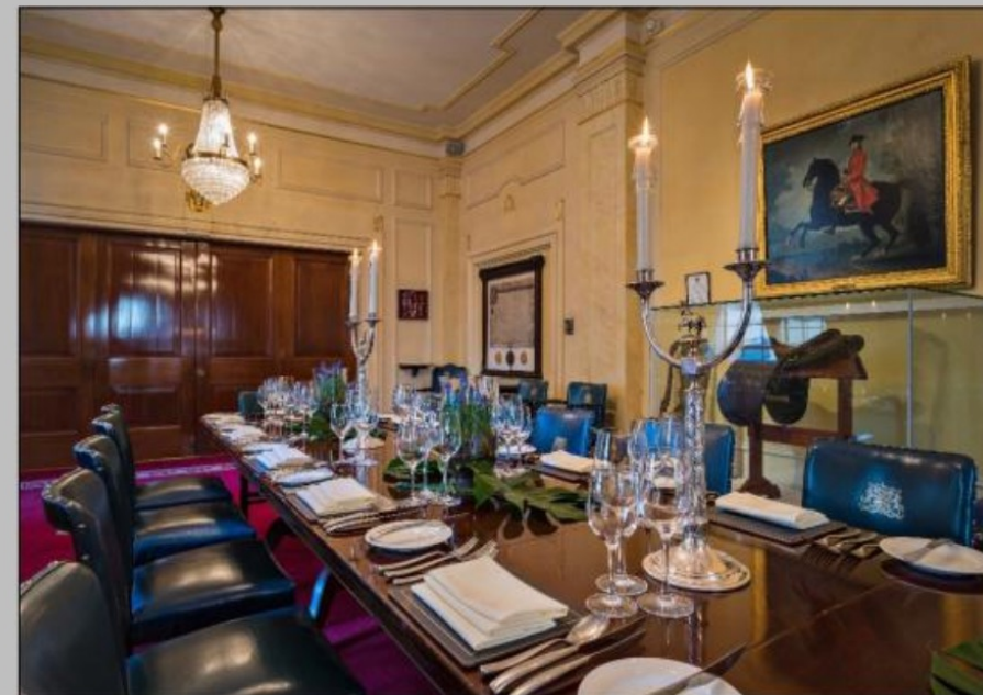
The Livery Room