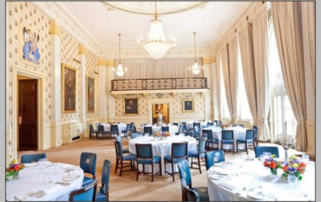
The Great Hall