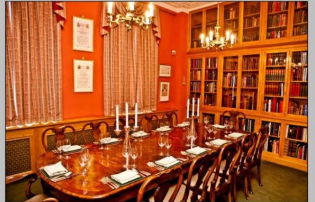
The Charter Room