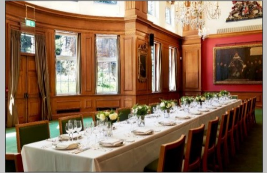
The Great Hall