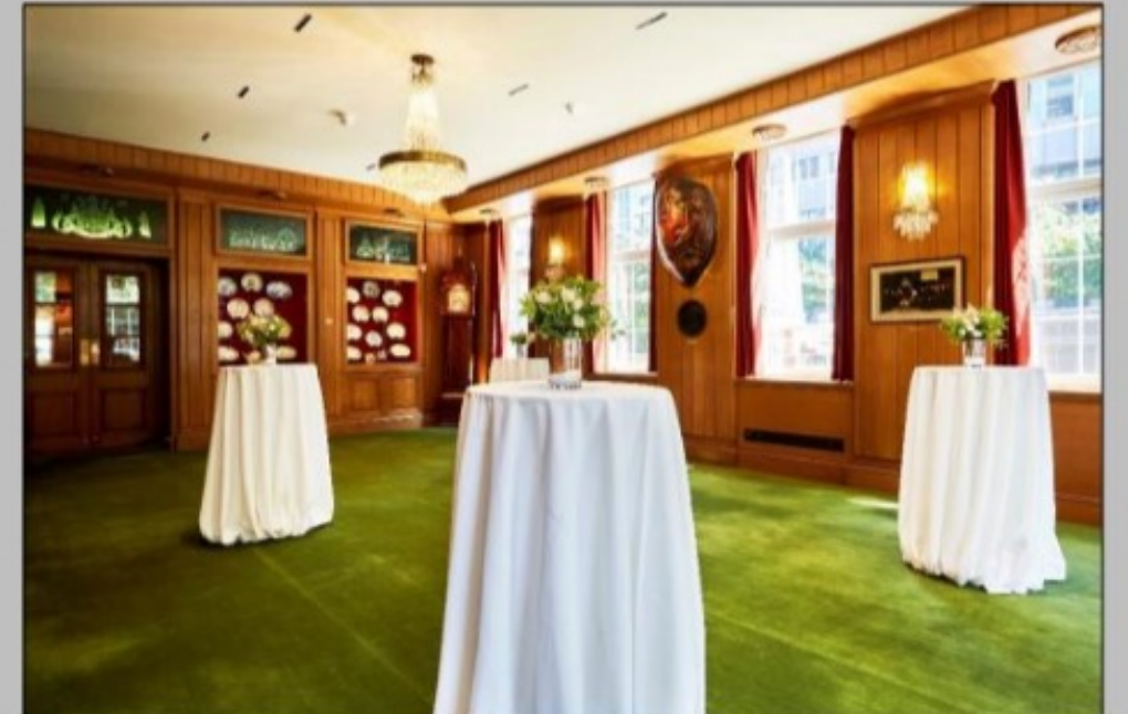
The Reception Room