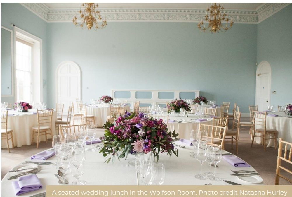
A seated wedding lunch in the Wolfson Room.

Celebrate your wedding day in our central London townhouse.