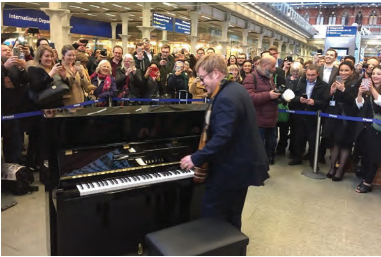
(L) ELTON JOHN PLAYING THE PIANO (R) JEFF GOLDBLUM